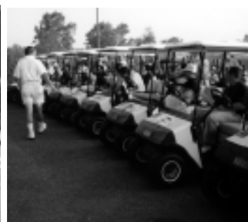
Golf tournaments attracted up to 250 participants, probably the most popular event for management personnel.