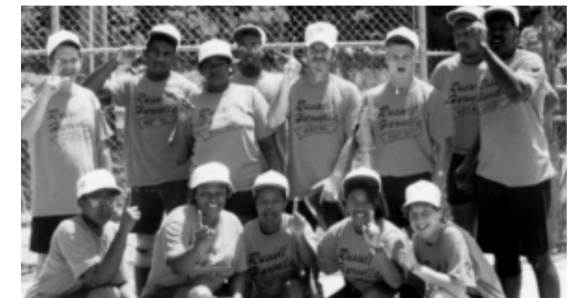
Team pride...Russell-Harvelle Hosiery softball team.