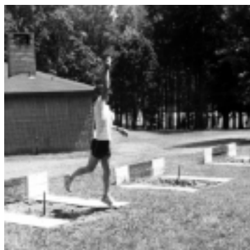
Pitch in...a horseshoes tournament in the Sandhills has serious contenders.

In-plant luncheons for employees helped in the bonding. Talent shows, fund-raising raffles for the scholarship fund, art contests for children were in the mix along with industry-promoted outings to motor speedways, baseball games, and entertainment parks. Committees worked almost year-round.