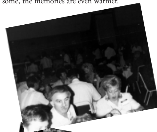
Food outings...Hickory area people converged on Country Adventure Barbecue Barn while Sandhills gatherings enjoyed outdoor picnics.

Still there are some who think about "Celebrate Hosiery" when the warm days of August arrive. For some, the memories are even warmer.