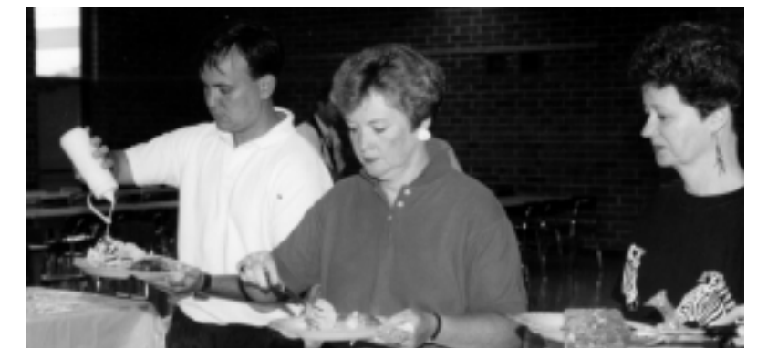
In-plant luncheons brought Celebrate Hosiery closer to home.