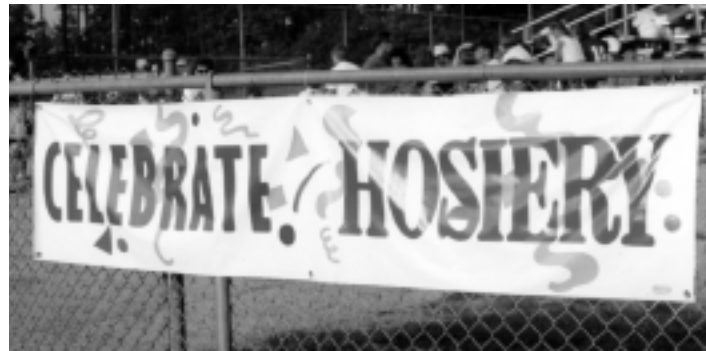
Celebrate Hosiery banner greeted hundreds of hosiery industry participants at events across North Carolina.

In-plant luncheons for employees helped in the bonding. Talent shows, fund-raising raffles for the scholarship fund, art contests for children were in the mix along with industry-promoted outings to motor speedways, baseball games, and entertainment parks. Committees worked almost year-round.