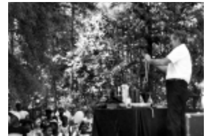
Magic show entertains children at the Biscoe picnic 12 years ago.